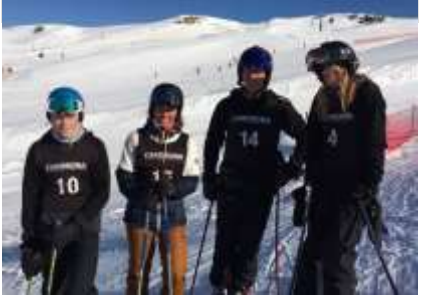
OSS Ski/board Championships Cardrona