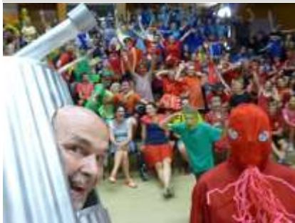
Arts Week - Dr Who

Once our seniors leave I regularly remind our students that finishing strong is part of how we do things here, raising the bar that little bit higher for ourselves and our peers and living the values of our Kawa: Respect, Courage and Personal Excellence. Our Junior Prize Giving last Friday evening was part of finishing strong and it was a fitting tribute to the many achievements of our students this year. Congratulations to all who achieved their goals this year and crossed the stage on Friday night. The holidays are an ideal time to reflect on how 2017 went, to reset goals for 2018 and return to make next year an even better one. Tino pai rangatahi mā.