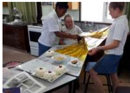
Y10 Christmas Cake Making