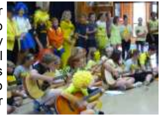
Winning House - Nevis

Dr Who, Where, When, What and Why was the theme of our Arts Week finale. Every year Arts Week allows our students to shine in their leadership, teamwork, enthusiasm, effort, creativity and school spirit. Inevitably they produce entertaining visual spectacles that show enjoyment, skill and pride. In this year's Arts Week the chief Dalek ensured that everyone obeyed, no one was exterminated, the Tardis landed safely and Doctor When (Nevis) prevailed on the day.